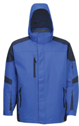
Imperial Blue/ Navy/ Navy