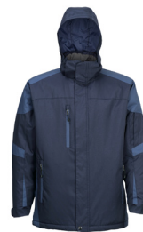
Navy/Mountain Blue/ Mountain Blue