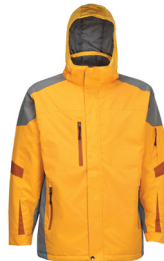
Mango/Gray/ Burnt Orange