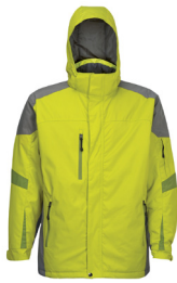
Lime/Gray/ Dark Lime