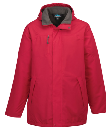
Red/ Midnight Charcoal