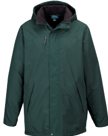
Forest Green/ Black